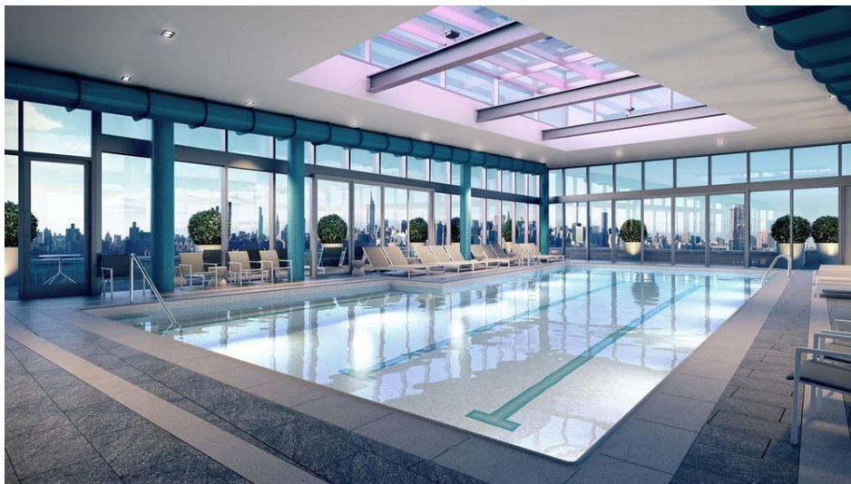
Indoor/Outdoor Pool with skyline views.